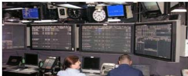
Aviation Management Info Systems