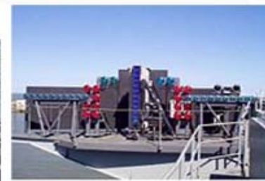
Visual Landing Aids