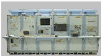
Automated Test Equipment